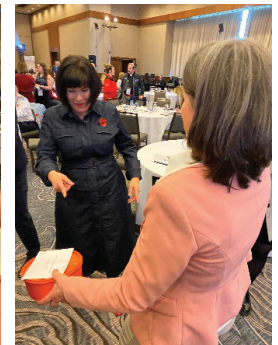
Is that my Tupperware?