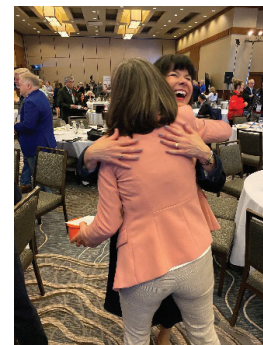
Thanks for returning it...