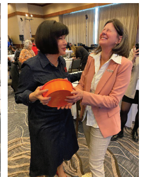
in the middle of the Summit!