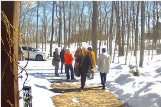
Photo Caption: We were so enthralled with our conversations with members of the CAF TG team that we forgot to take a photo. Please enjoy this shot we lifted from our doorbell feed while we were chatting outside.

The Transition Group plays a significant role in the well-being of departing CAF members and there are similarities between the Transition Group mission and that of the Pepper Pod. It was great to welcome their team and share more about the services we offer.